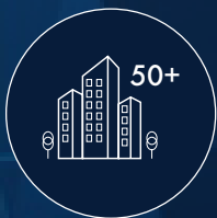
Companies with more than 50 employees